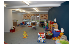
Photos of our purpose built refuge in York

If you are not safe in York or Harrogate or if we are full we will find you somewhere else to stay. We will also find you somewhere safe if you are a man who is escaping domestic abuse.